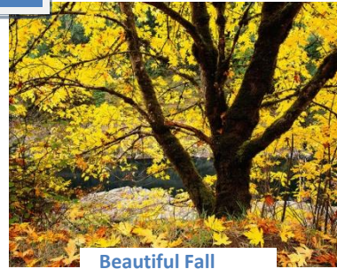
Beautiful Fall Ambience!

Greetings, Chamber members! Great News!! Not only is our e-Newsletter about to have a brand-new look, so is our Membership offer! The new format for membership is in its' final stages of change! We are very excited to be able to offer the choice of level of membership to you, our loyal supporters. This will be coming very soon as a separate email as our goal is to have all of our memberships in place by January 31 st , 2015, so an early start to the process is our goal!